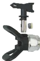
Turn clean nozzle