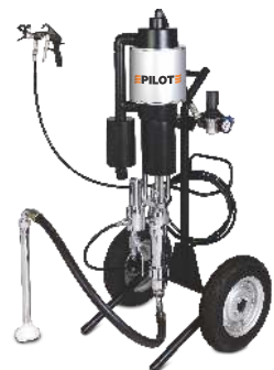
Pneumatic Driven Series