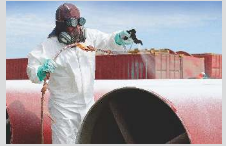
Pipe & other protective coating