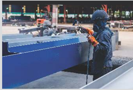
PEB & industrial structural fabrication