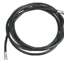
High pressure hose