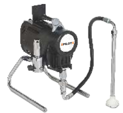
Electric Driven Series