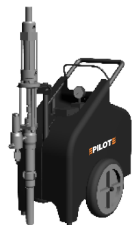
Hydraulic Driven Series